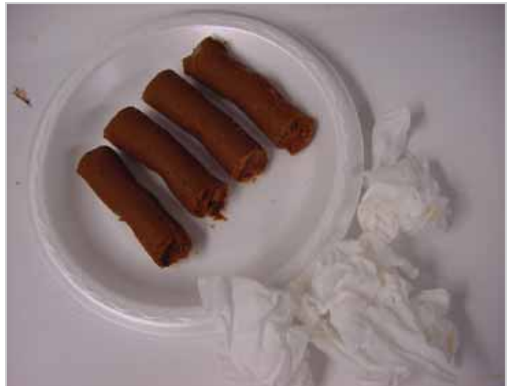
Figure 3 Extruded soybean paste, toilet paper

To obtain realistic and indicative test results it is necessary to use realistic test media and a realistic test protocol. The test media, or “waste” used in this study consisted of four 50 g test specimens (200 g total) of extruded soybean paste 6 plus four balls of loosely crumpled toilet paper; the soybean paste used in this study has physical properties similar to that of human waste. Like human waste, the soybean paste was free to break up into smaller pieces and either spread out or ‘clump up’ in a ball as it is moved through the drainline. In some test runs the media cleared the entire length of piping; in other tests the media came to rest within the piping.