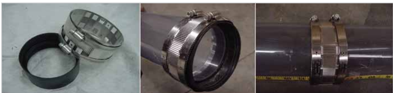
Figure 2 Plastic pipe and coupling